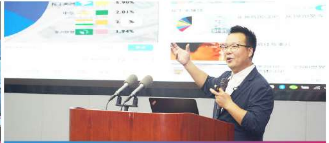
Chinese Path to Modernization and International Trade, by Libin Luo