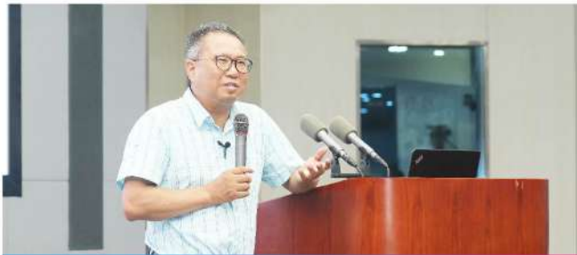
Trends and Behavioral Characteristics of China's Outbound Tourism Consumption in the New Era, by Tongqian Zou