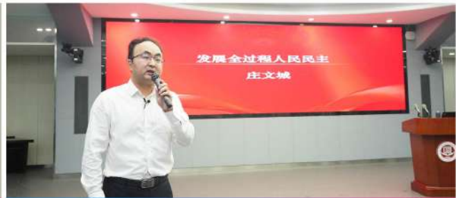
Develop Whole-process people's democracy, by Wencheng Zhuang