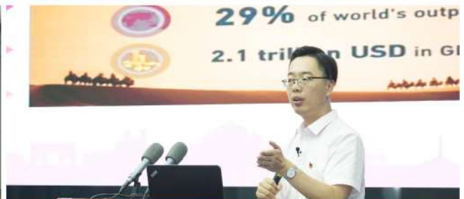
World Dream: One Belt and One Road, by Yang Xiao