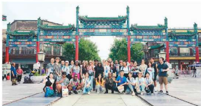
图为8月9日,暑期班学员参观中轴线时,在前门大街合影。

在接受采访时,多名学员表示,在中国的所见所闻令人难忘,中国式现代化成就令人惊叹,中国城市发展经验值得借鉴,他们愿为中外友好交往积极贡献力量。