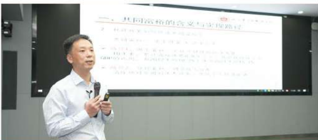
Chinese Modernization and Tax Policy, by Tao Ying