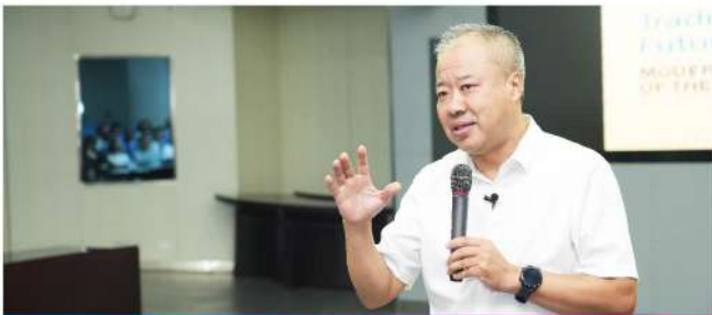
Traditional China, Realistic China and Future China, by Miao Yu